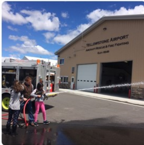
West Yellowstone Elementary School students.